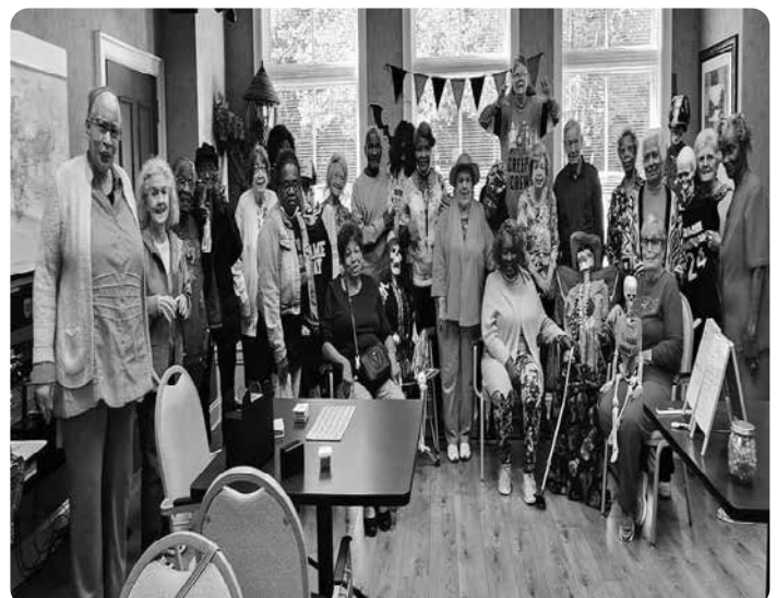
Our STARs celebrating Halloween together at their all-inclusive party!