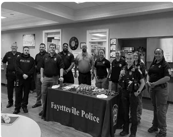
Some of Fayetteville's finest from the PD at Coffee with a Cop.

Check out the collection of books and magazines of all genres that we have available for pick up at both our Peachtree City and Fayetteville locations! Have some you aren't using? We are currently accepting book donations.