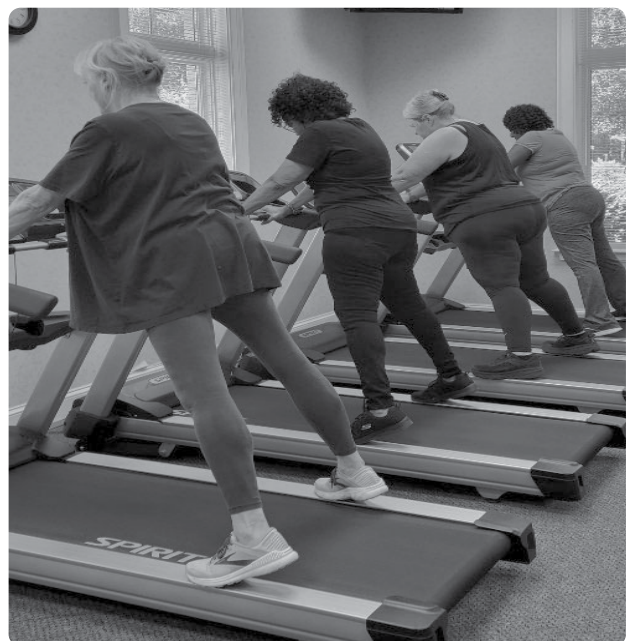
Members working out during the Tread Lightly treadmill class.

Proceeds go to further benefit the STARS program.