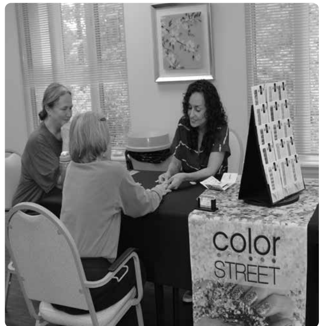
Members being pampered getting nails done at the center.