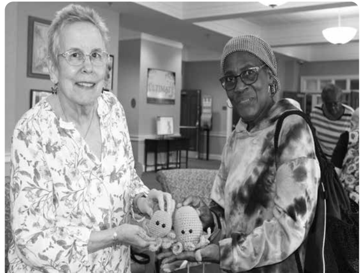
Members from the crochet group showing off their project!