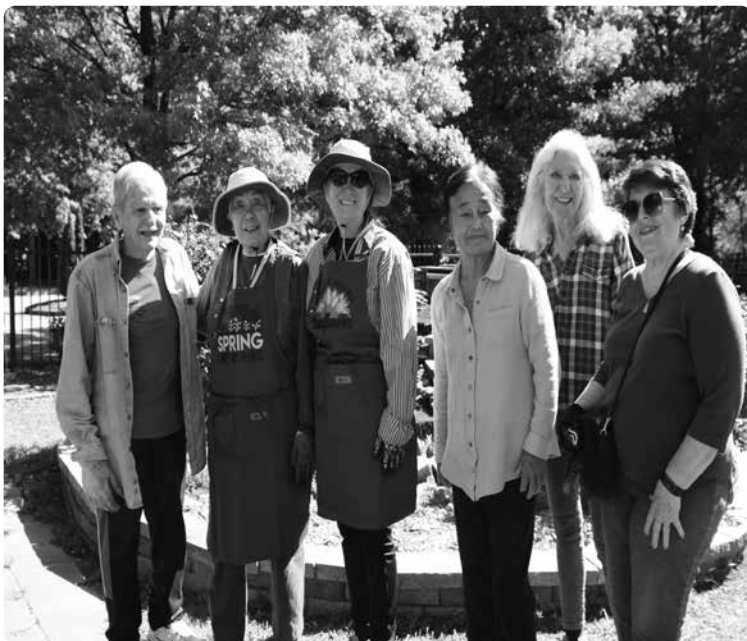
Some of our wonderful, hardworking garden volunteers!

CLASSROOM PARTICIPATION REQUIREMENTS: Participants must be mobile as well as physically, mentally, and medically able to participate without disruption in any class or activity. Fayette Senior Services reserves the right to evaluate participants to determine an individual's participation ability. Some classes require a medical release and/or a fitness readiness questionnaire.